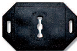
Heavy moulded stabilizer 432 x 686 mm (17 x 27") 19,5 kg (43 lbs) #33043-VRB