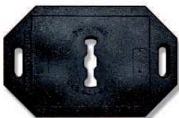
Moulded stabilizer 432 x 686 mm (17 x 27") 13 kg (28 lbs) #33028-VRB